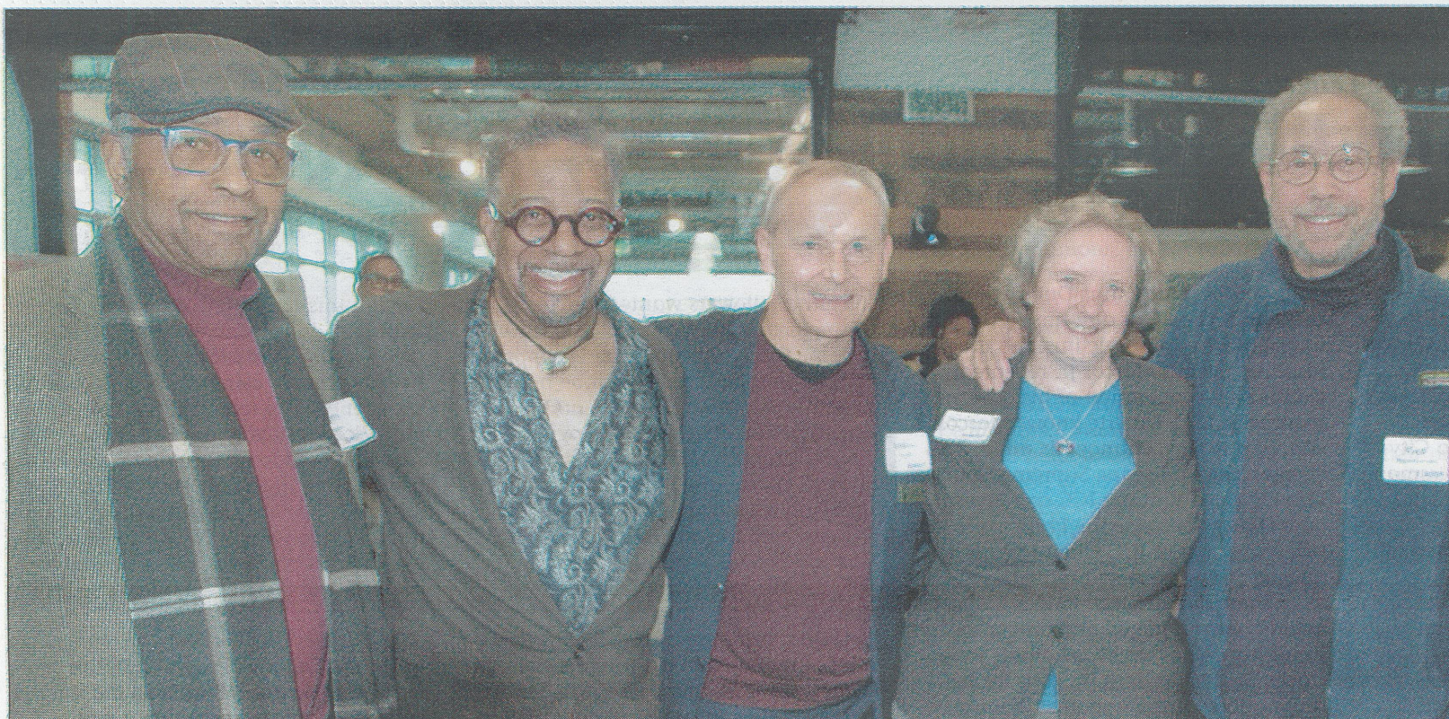
The Wisconsin Chamber Orchestra Releases "Harmonies in Black"